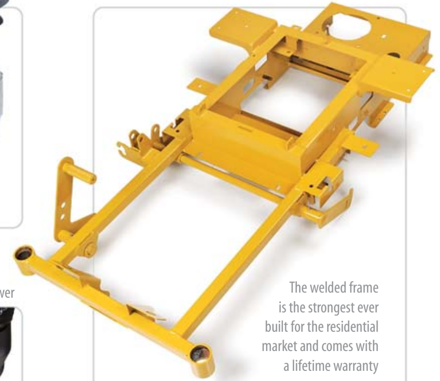
The welded frame is the strongest ever built for the residential market and comes with a lifetime warranty

Honda or Kohler engines provide plenty of high-torque power